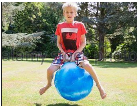
2. 10 bounces on the space hopper