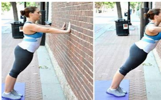
5. 10 Push-Ups against the wall