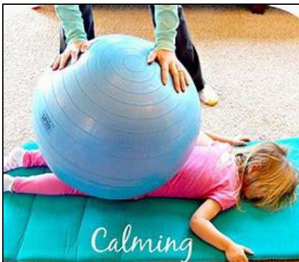
6. Massage with exercise ball for 5 minutes