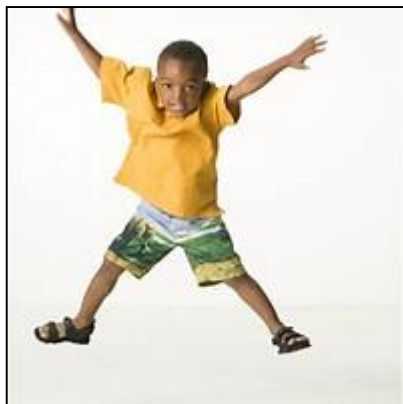
1. 10 Star Jumps