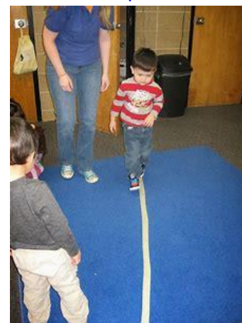
4. Walk along the straight line and back again 5 times